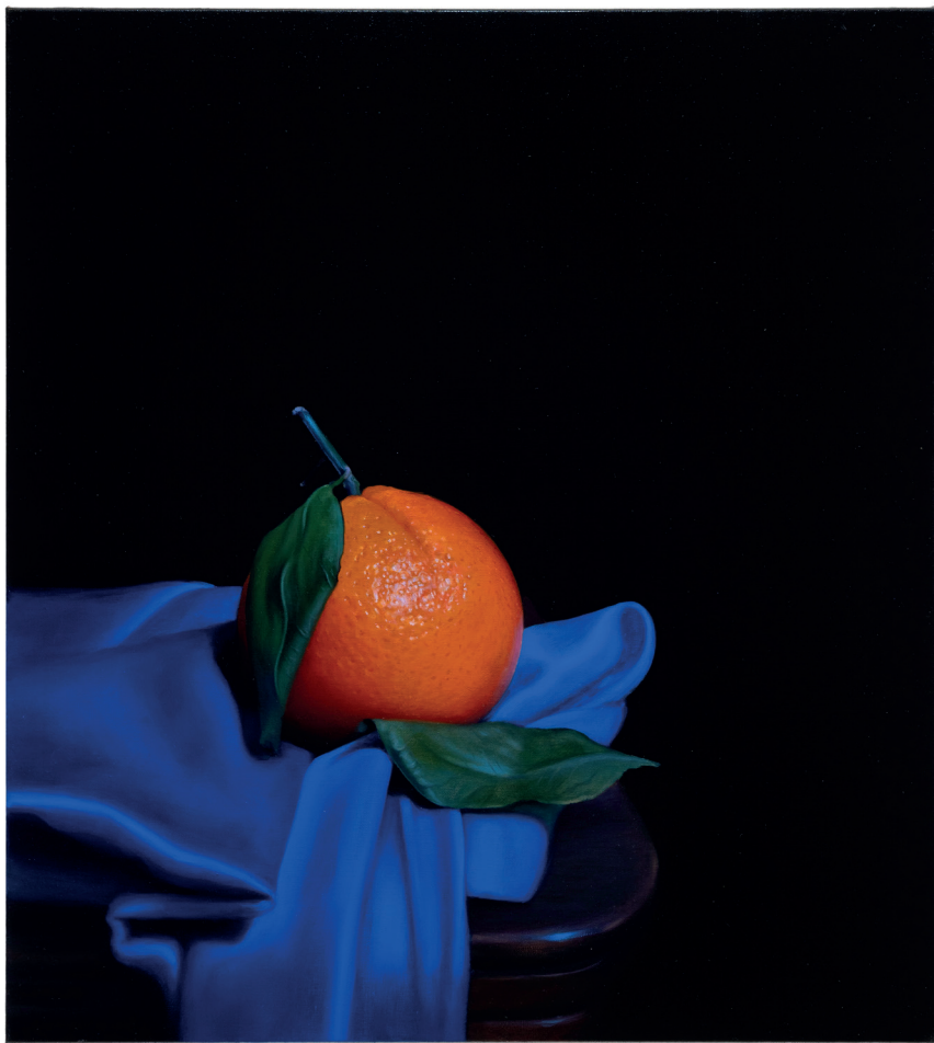
Abdelhak Benallou Sans titre , 2024 Oil on canvas 60 x 50 cm