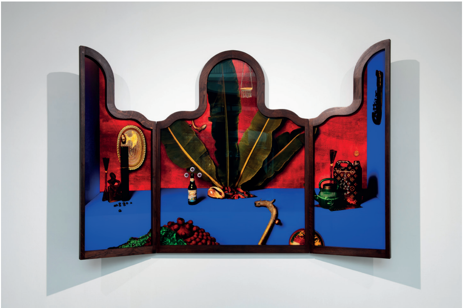
Maya Inès Touam, Retable Agoodijé et sa reine , 2022 Fine Art print on Hahnemühle paper, framed in plexiglass, two-panel solid oak retable with ogee arch Close : 116 x 90 cm - Open : 116 x 180 cm