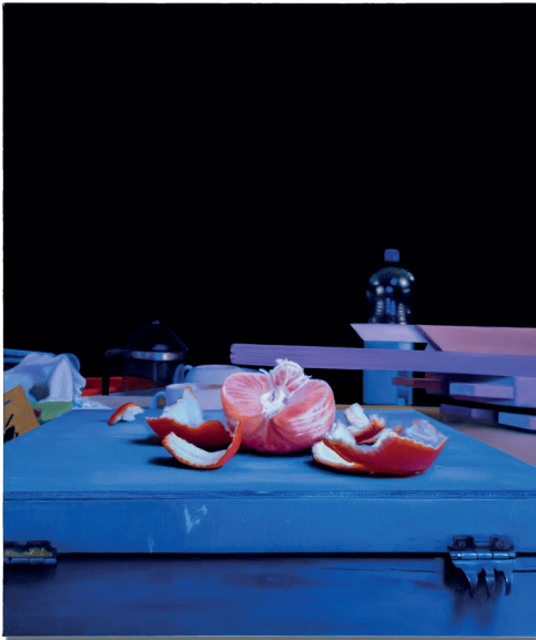
Abdelhak Benallou, Sans titre , 2024 Oil on wood 65 x 50 cm